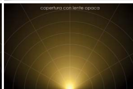
copertura con lente opaca