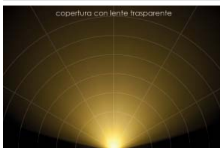
copertura con lente trasparente